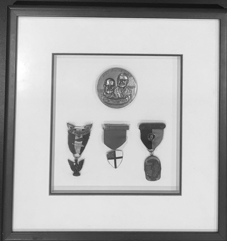
E. Urner Goodman Founder's Award