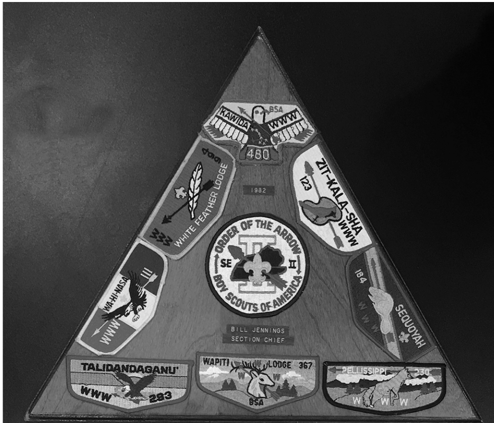
Section Chief of Section Southeast Region II (TN & KY)