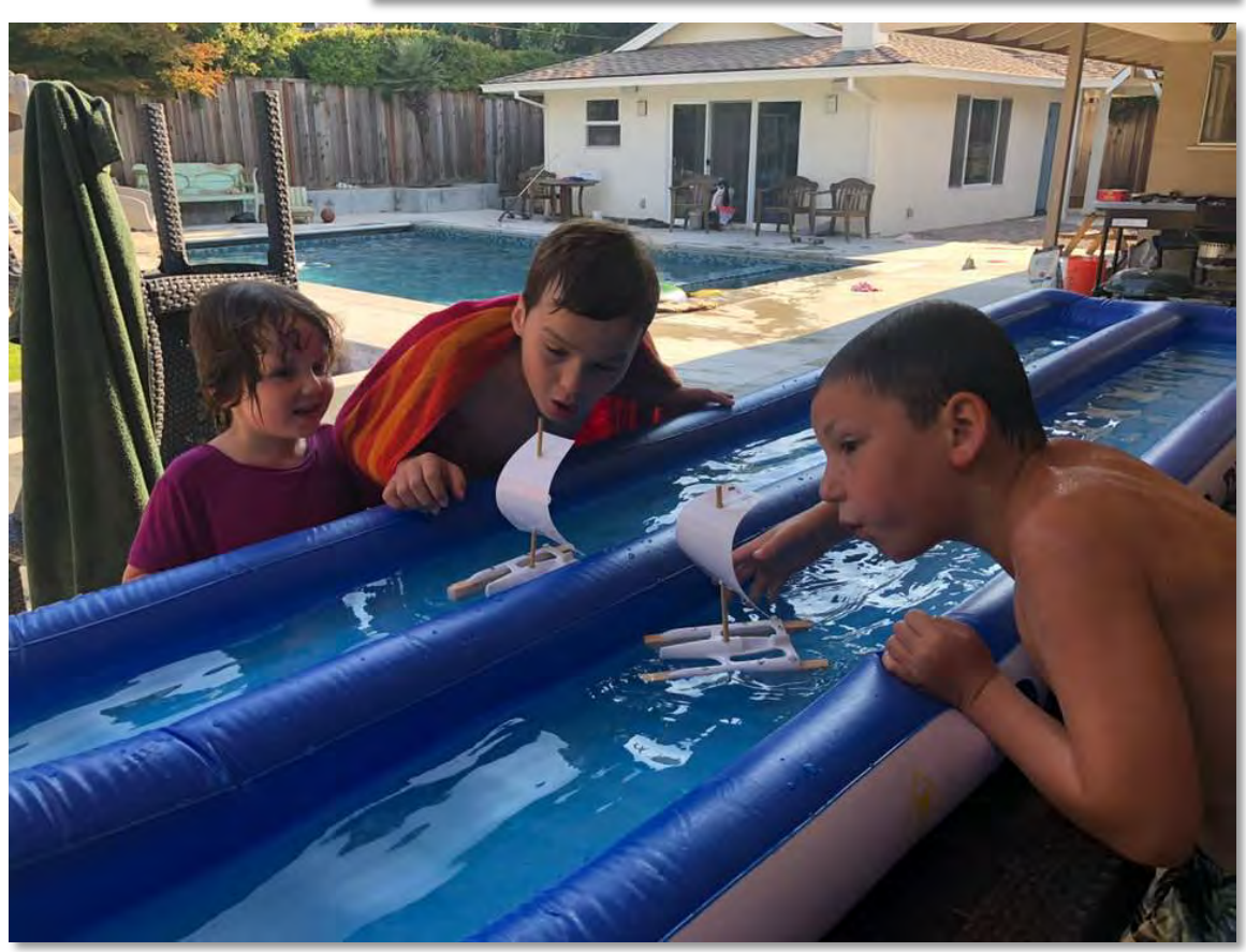
Raingutter Regatta Practice