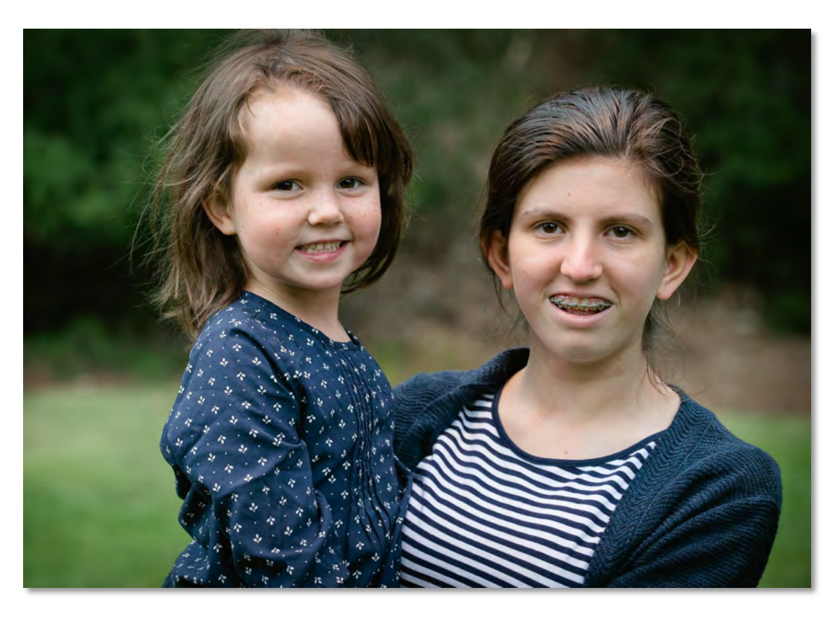
Family photographs in September 2018 at Blackberry Farms, Cupertino