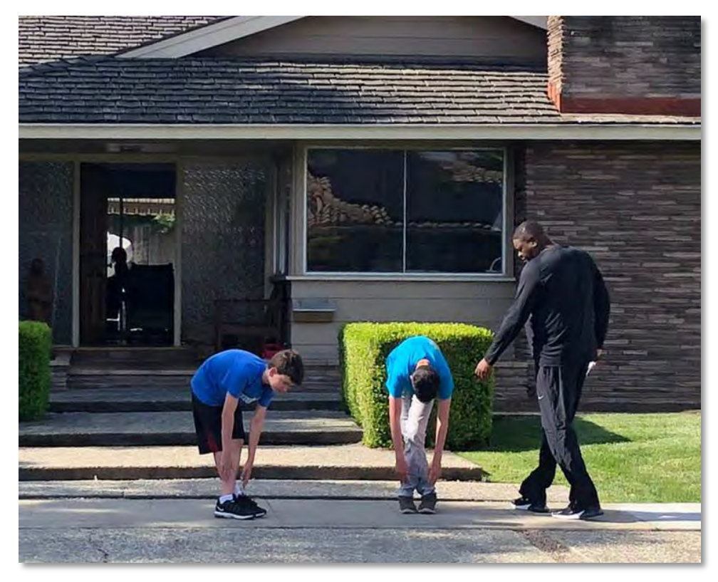
Warm up before Coach runs the lads through the paces