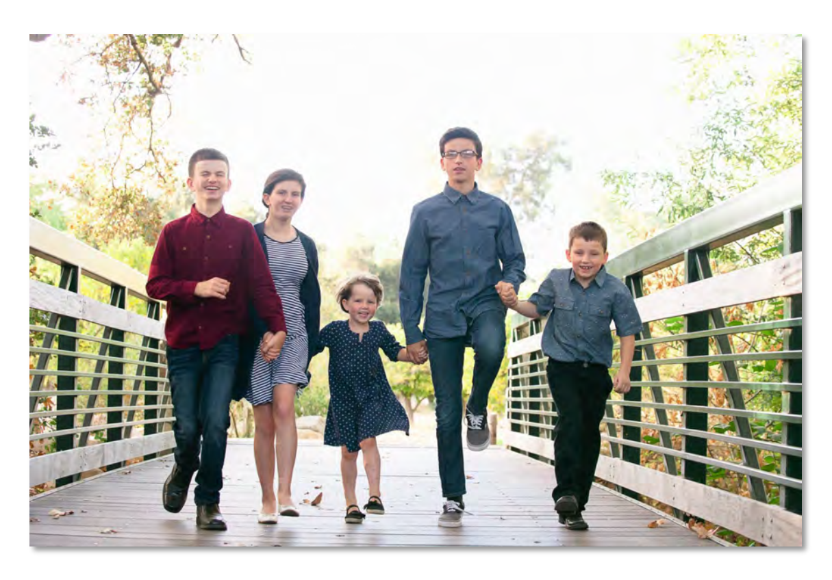
Family photographs in September 2018 at Blackberry Farms, Cupertino