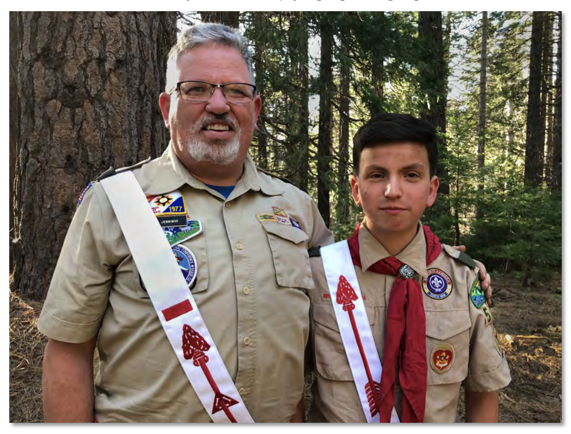
Firm bound in brotherhood, gather the clan