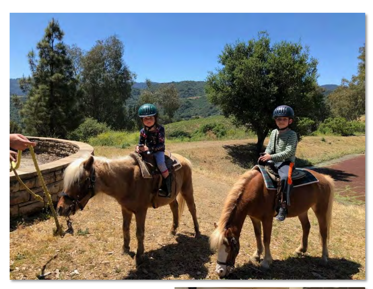
Pony Rides at Cooper Garrod May 2018