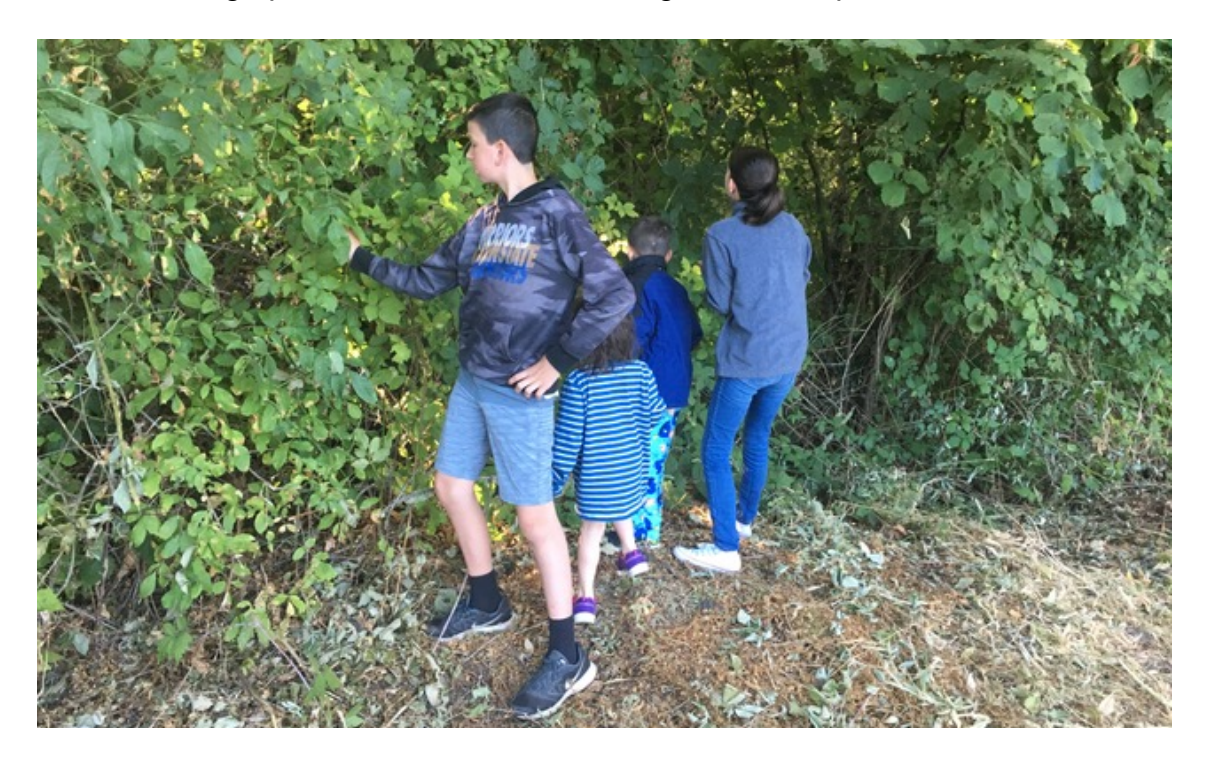
As the Eclipse was nearing totality, the shadows became crisp and intense - so the team jennings broke out into song! YMCA... To see the shadows, of course.