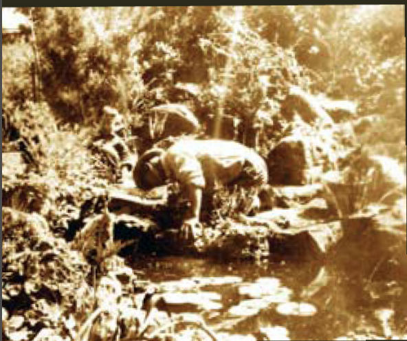
Shoichi Kagawa & son in the garden